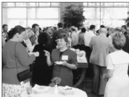
ARIA members get acquainted at the Monday night reception.